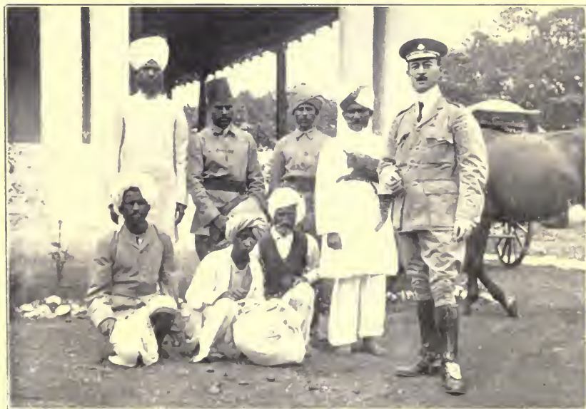
MY BACHELOR ESTABLISHMENT.